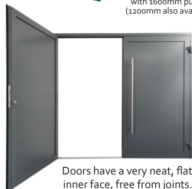
Doors have a very neat, flat inner face, free from joints.