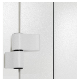
The paint finish is a highly-durable powdercoat ripple texture that gives an attractive finish with excellent resilience.

Doors are available in a classic ripple -textured finish in the solid colours shown below: