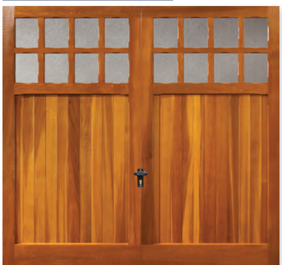
Cedar boards and mouldings