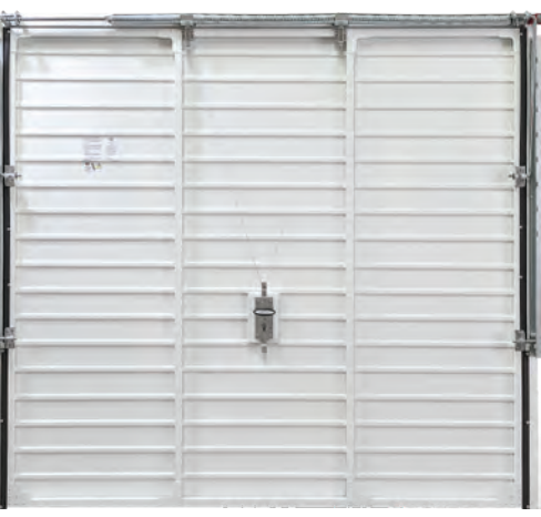
The inside face of our canopy doors showing the twin point lock latches and the high quality corrosion protected components.