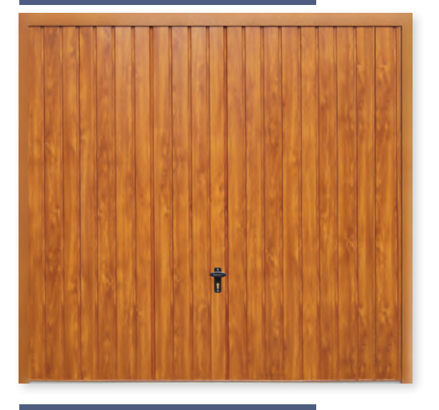
Standard Rib Vertical - Golden Oak