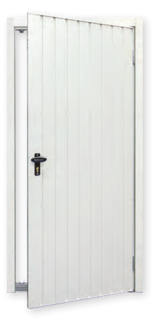
Matching personnel doors share the same quality construction and ease of use.