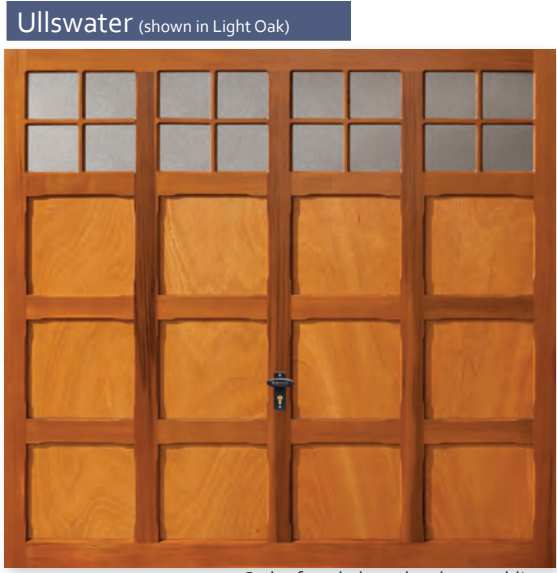
Cedar faced ply and cedar mouldings