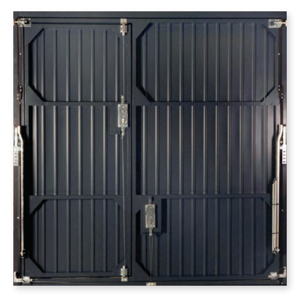
The inner face of the Smartpass door.