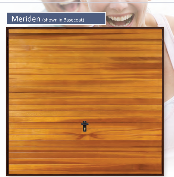
Tongue & groove cedar boards