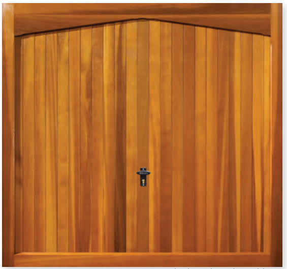
Cedar boards and mouldings