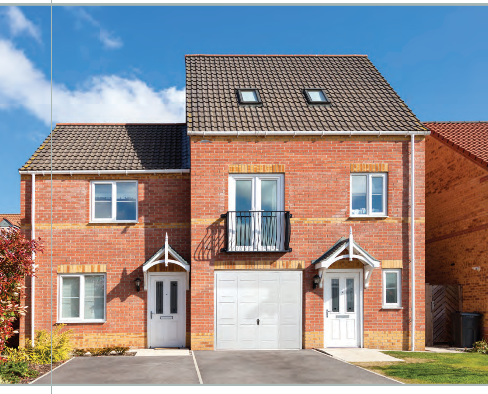
Chester Horizontal Small Rib with Waterford windows