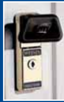
BRASS EFFECT EUROLOCK (OPTIONAL)