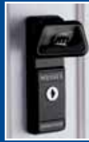
BLACK EUROLOCK (STANDARD)

All doors feature triple-point lock latches activated by an attractive choice of handles.