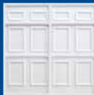
3 CROWN INTERIOR FACE

5 Crown – Garage doors in standard and made to measure sizes, with an integral steel frame encapsulated in insulating foam within a flat textured G.R.P. panel bonded to the rear of the door. This provides supreme rigidity and an attractive backing. Available with Retractable gear only. Due to the foam filled double wall construction of these doors, no translucent window options are available. 5 Crown is not available for doors over 3048mm (10'0") wide and 2134mm (7'0") high.