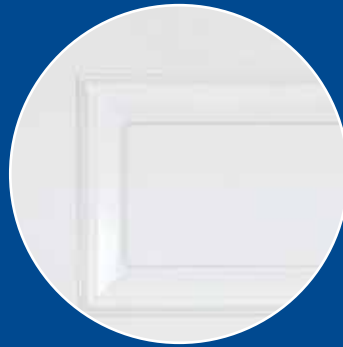
White gloss panel detail

Our popular range of Brilliant White High Gloss G.R.P. doors is designed to complement any home. With a variety of traditional and exclusive designs made solely to order, each door is hand-built and specified to your requirements. With a low maintenance surface there are no unsightly seams, welds or joins to detract from their carefully crafted styling.