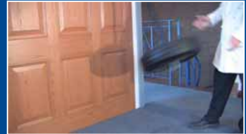
IMPACT TESTED FOR STRENGTH

For details of additional ranges available from Wessex Doors please see our main Range Guide or visit www.wessexdoors.co.uk .