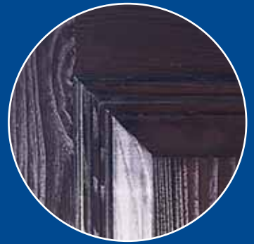
Woodgrain panel detail