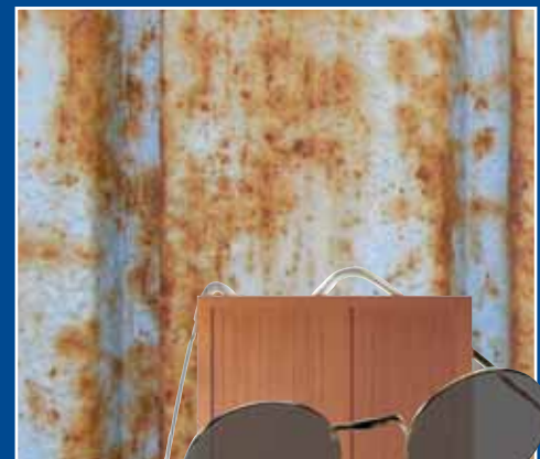
NO MORE RUST!